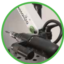
Orientable Head V-H, 4x90°